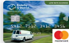
Enderby & District Financial Collabria Low Rate Business Mastercard®